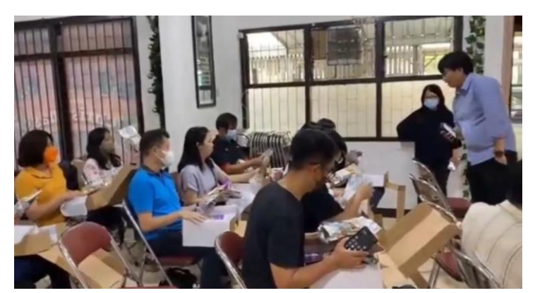
Figure 3. Providing examples of MSME products

The speaker said that there are 5 basics to using the internet to do business, namely market research, product research, packaging research, marketing, and financial records. This session included providing examples of good MSME products. Participants tried the taste of each product as well as looked at the packaging design for discussion.